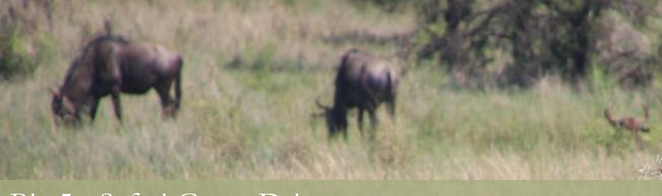
Big 5 - Safari Game Drives Zebras, Giraffes, Elefants, Lions, Buffalos, Lepards...